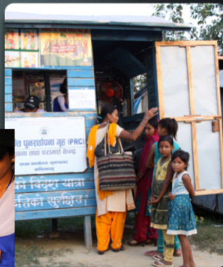
Actual interview in progress